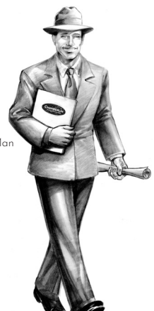
The Chamberlin Man